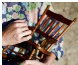
Bercher le temps