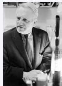
Alfred Pellan

Enjoy an evening of short films at the Stewart Hall Art Gallery. The short films include Voir Pellan , a documentary about the discovery of modern art in Paris, by artist Alfred Pellan, and about his desire to share modern art in Canada. This film, directed by Louis Portugais , also reveals the artist's process and answers the question, "What is modern art?"