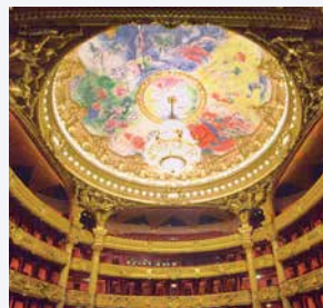
Marc Chagall, Opéra Garnier