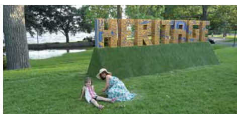
Nicole Dextras, HERITAGE , 2017