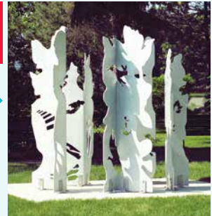
André Dubois, Les ombres claires , 2017