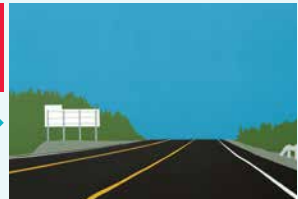
Kym Greeley, Glimpses of Consciousness , acrylic on canvas, 2016