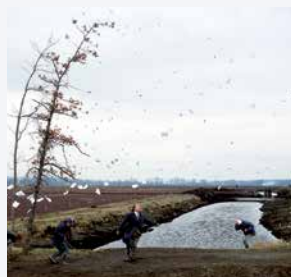
Jeff Wall, A Sudden Gust of Wind (after Hokusai), 1993.