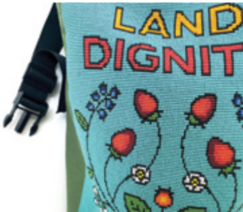
Olivia Wethung, This stubborn, apparently limited, narrow-minded aspect of the people , 2020